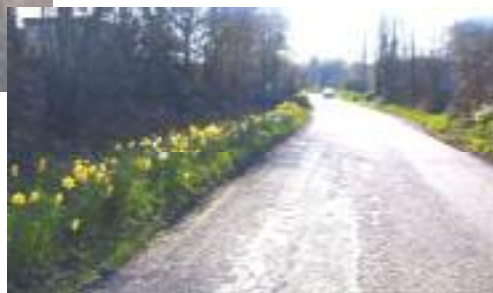
Right - Bottom of Church Hill