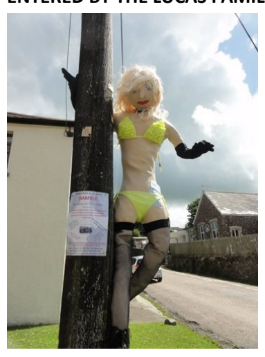
POLE DANCER BEST IDEA SCARECROW ENTERED BY NEEP FAMILY