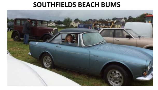
HEATHER DARWIN IN HER SUNBEAM TIGER 1965