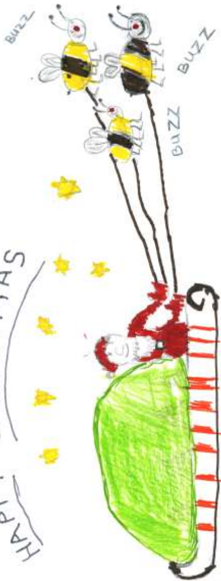
Harvey Cholwill Aged 7