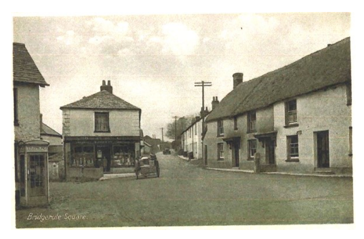
THE OLD AND POSSIBLE THOUGHTS OF A NEW!!

The Village Hall Committee meet later in January 2020 with an item on the Agenda which I hope you will be interested in; that of a village shop.